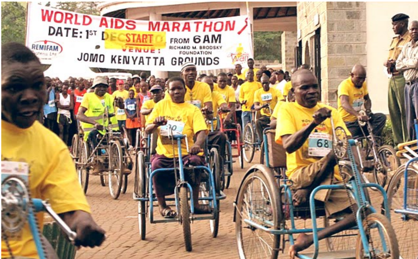
The 2010 World AIDS Marathon had 404 finishers, including 29 wheelchair athletes.