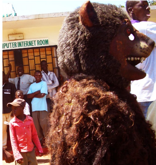
Pictured left and right: children, and a “bear,” from the 5K Children’s Walk.

The 2008 World AIDS Marathon and related events were attended by over 1,700 people. The Richard M. Brodsky Foundation kept its promise by making the World AIDS Marathon a memorable event to orphans, runners, individuals whose lives have been affected by HIV/AIDS, and the people of Kisumu, Kenya. Your contribution also helps to support our local and global communities! By contributing to Richard M. Brodsky Foundation, you enable us to continue our mission of educating, caring and supporting vulnerable members of our society. We view our donors as partners and believe it is our responsibility to ensure all gifts entrusted to us are put to the best use. Donations are tax-deductible and support our work year-round. To get involved, please visit: www.richardmbrodsky.org and click on DONATE.