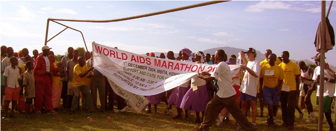
Above: 2004 World AIDS Marathon, Mbita Kenya. Below: Little Lambs Orphanage in Nakuru, Kenya.