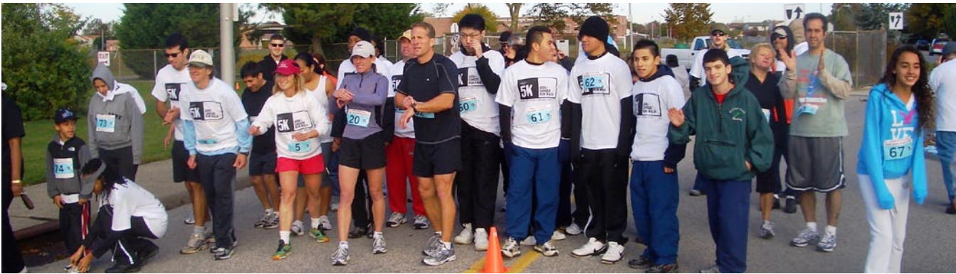
Pictured above: start of the 2009 FREE 5K Run/Walk for HIVers, Cancer Survivors & Friends in scenic Oceanside Park, NY. Pictured below: two paths diverged in Oceanside Park fronting West Bay. We hope you will choose the water view to finish the 5K Run/Walk.

The Richard M. Brodsky Foundation will be sponsoring its 3rd annual 5K FREE Run/Walk for HIVers, Cancer Survivors & Friends on October 30, 2011. The reason for these FREE Events is that I believe running is largely responsible for why I am still alive today and I'd like to share that gift with as many people living with HIV/AIDS or cancer as possible. Even if you cannot run three miles you can walk the 3-mile water view course. We ask that you get your doctor's consent ensuring you are fit to run the 5K, however we do not require a physician's note. Each loop of the course is one mile so even if you run or walk a portion of the course, it's a great opportunity to make new friends, enjoy a sumptuous breakfast, receive a personalized Event t-shirt, and be eligible for a few thousand dollars in FREE raffles. At the last two 5K Events we gave all the participants $45 in toiletry/gift items. We ask all the participants to accept these items so no one will know who is healthy and who is not. During the first week of November 2011, if you are healthy, we ask that you donate the toiletry/gift items to someone who is living with HIV/AIDS or cancer.